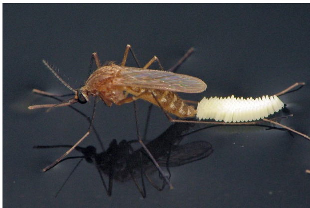
Figure 2. Standing water mosquito and eggs ( Culex quinquefasciatus )

Mosquitoes that are not in the “floodwater” group lay their eggs on standing water. Another difference between the two groups is that mosquito eggs in this category can not withstand drying out. If the water dries up, or the egg gets stranded on the grass or soil, the egg dries and that will be the end; it will not hatch into a larva.